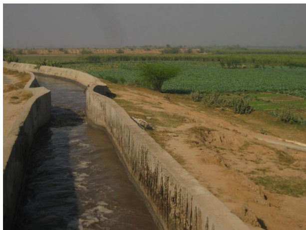
Fig. 1: Municipal wastewater drain passing through the agricultural fields in peri-urban area of Faisalabad for irrigation purpose.

Constant use of such industrial water for growing vegetables may cause bioaccumulation of heavy metals up to toxic levels for health. Heavy metals can enter human bodies through the food chain, consequently causing increased incidence of chronic diseases such as cancer and deformity. (Muller and Anke, 1994). The use of wastewater in agricultural land is a common practice in urban and sub-urban areas of the industrial megacities of Pakistan including Karachi, Lahore and Faisalabad. This is because of the fact that wastewater has nutrients and enhances soil fertility. Hidri et al. (2014) found that the proper management of wastewater for irrigation and regular monitoring of soil health, fertility and quality parameters are essential for successful, safe, and long-term reuse of wastewater for agricultural uses.