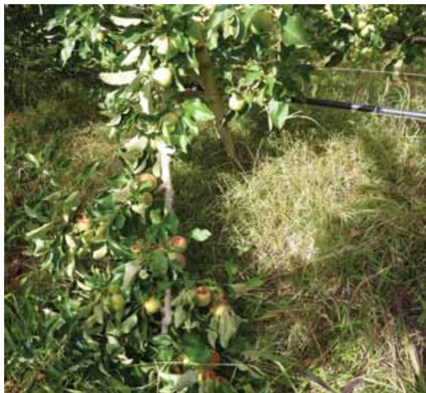
Sunburn damage on Sundowner apples, three days after sudden limb movement.