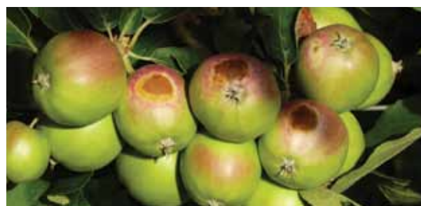
Early sunburn on young Sundowner apples (early December 2010)

Also, the manual focuses mainly on sunburn in fruit, which is the obvious visible symptom of an excessively warm climate. During the hottest part of the day, when air temperatures rise above 30 to 35°C, fruit tree photosynthesis is likely to slow, causing general heat stress, which will reduce potential fruit yield. This manual will not deal with this in detail, but we can expect that sunburn control options will also have some general yield benefits due to reductions in general heat stress on trees.