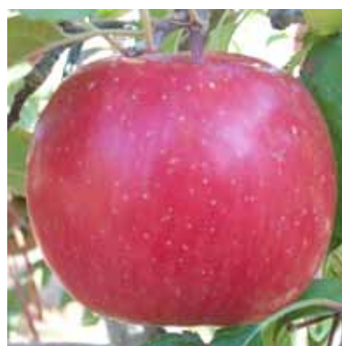
Fuji apple with three applications of wax-based sun protection.

Results from this product in northern Victoria have been variable, depending on how it has been used (see Case Studies at the end of this manual).