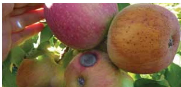
Sunburn on Sundowner apples (early April 2011)