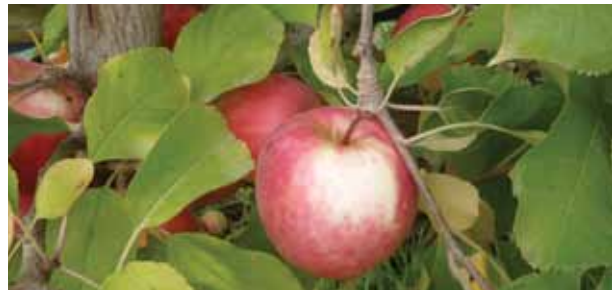
Photo-oxidative bleaching on a Pink Lady apple 5 days after a front apple was removed for the first colour pick, early May 2011

Even a small amount of yellowing or browning caused by sunlight can limit a fruit grower's markets. For example, hot weather and direct sunlight can cause Granny Smith and other varieties of green skinned apples to become slightly yellow or red. This can lead to very costly downgrading of the fruit when the market is demanding bright green apples. It is not unusual to have 30 per cent of a Granny Smith crop rejected for sun 'yellowing' (van den Ende 2004).