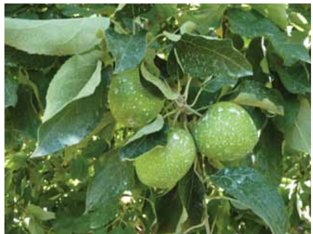
Clay-based spray-on sun protection.

Some independent scientific reports indicate these products can act like an insect repellent in fruit crops (Glenn & Puterka 2005). They have been used as a general preventative spray to reduce the amount of conventional spraying. It is assumed some insect pests find treated fruit unpleasant or they have greater difficulty finding the host.