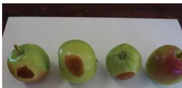
Sundowner apples 3 days after a 40°C day in December 2010