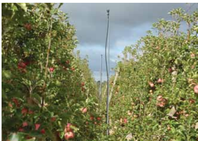
Over-tree sprinkler cooling system, with tall risers.