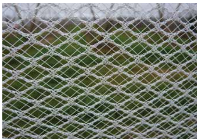
White 'quad' netting

Permanent shade netting may cause excessive shading in low sunlight intensity periods during spring that could potentially promote excessive shoot length, delay the onset of flowering and reduce fruit set. To avoid these problems,