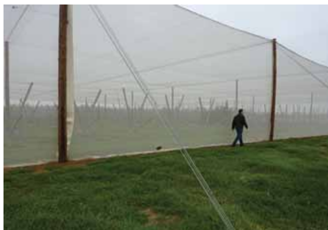
White permanent shade netting with enclosed sides to exclude birds.

Bees do not work as well under shade netting. It is advisable to introduce bee hives under the netted orchard during the blossom period and to allow some space between the top of the trees and the netting so that bees can fly freely along the tree rows.