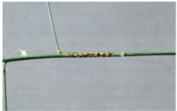
Figure 4. Brick-red pustules on a fern branch with rust.

Asparagus rust occurs to varying degrees wherever asparagus is grown. The fungus attacks developing ferns after cutting has been terminated. Rust may also develop on ferns allowed to develop during cutting. Rust appears first as raised, green spots (pustules) on stems and branches of developing ferns. Spores from these pustules re-infect ferns and produce brick-red pustules on stems and branches (Figure 4). A different spore type from these brick-red pustules also re-infects ferns and results in increased rust pressure. Rust is easily identified at this stage by observing the rust-colored