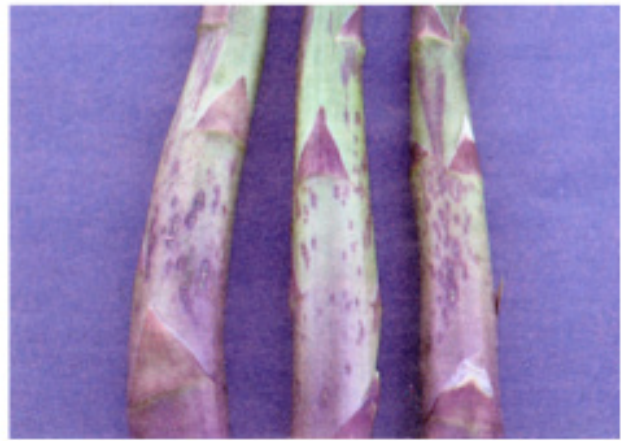
Figure 5. Purple spot symptoms on spears infected by the fungus Stemphylium .

Branchlet blight and die-back are diseases occasionally caused by Alternaria , but the damage caused by the disease in Oklahoma is considered minor. Stemphylium causes purple spot of spears and fern branches. Losses from this disease are from spotting of spears which reduces marketability. Symptoms appear as lesions (spots) that have tan to gray