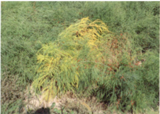
Figure 2. Yellowing of fern caused by Fusarium stem, crown, and root rot.

Control: Control of this disease is extremely difficult once it becomes established in a field. Therefore, measures should be taken to exclude it from fields. This is primarily done by planting healthy, vigorous crowns. For direct seeding, soak seeds in diluted chlorine bleach (1 pound of seed per gallon of a 1 part bleach/8 part water dilution) for 40 min., dry, and apply a fungicide seed treatment before planting. Consider