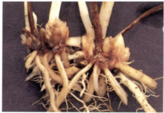
Figure 3. Symptoms of Fusarium stem and crown rot on a one-year old asparagus crown.

establishing beds with hybrid varieties that have some tolerance to Fusarium rather than with susceptible open-pollinated varieties. New fields should have good surface and internal water drainage and adequate nutrition provided before crowns are planted. Soil pH should be maintained between 6.5 and 7.5. Recommended pest, fertility, and irrigation management practices should be implemented to keep ferns actively growing throughout the season and to minimize stress. If the disease becomes serious, the field should be rotated away from asparagus. Re-establishment of asparagus should not be attempted in fields with a history of decline problems.